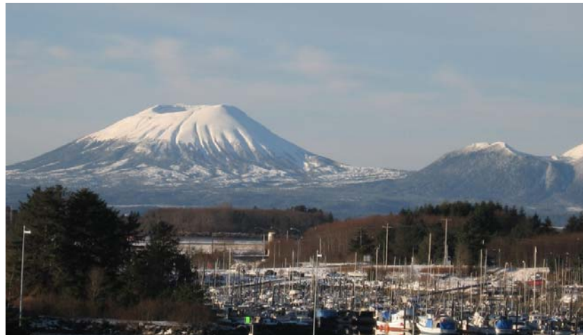
Photo 3: Mount Edgecomb (also spelled Edgecumbe) near Sitka, August 2005.